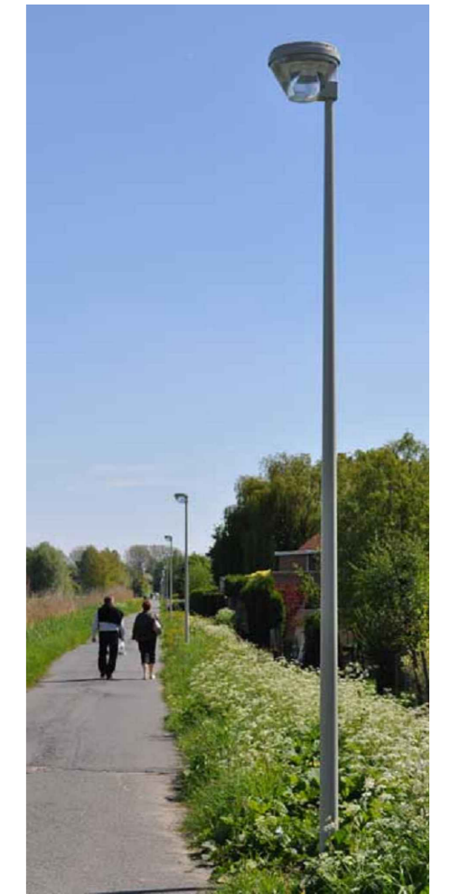
Pathway to be lit