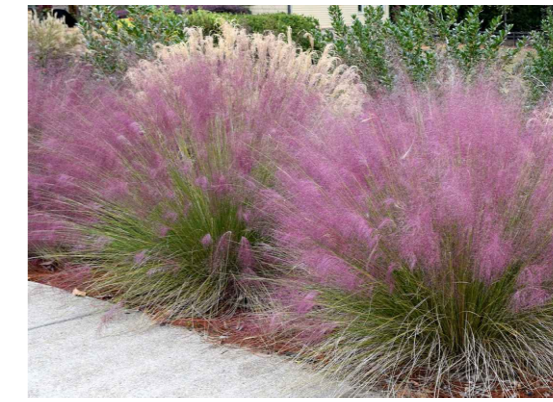
Planting along path