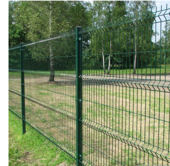
Weld mesh fence